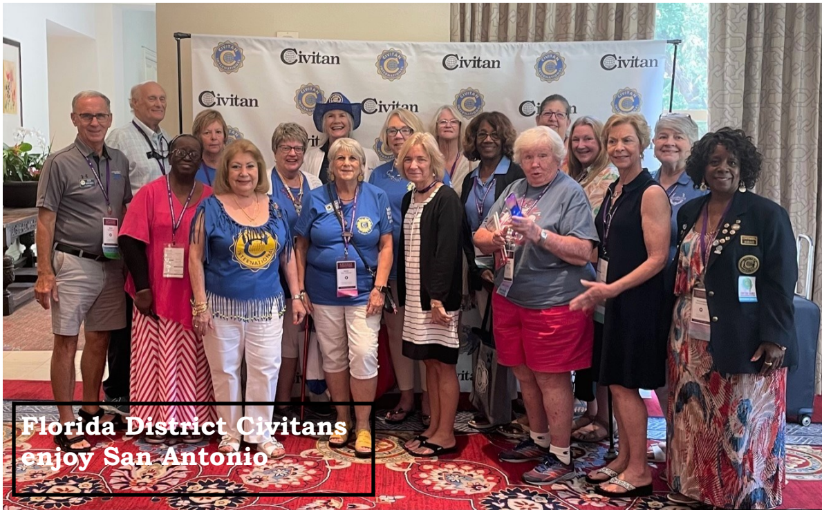
Florida District Civitans enjoy San Antonio