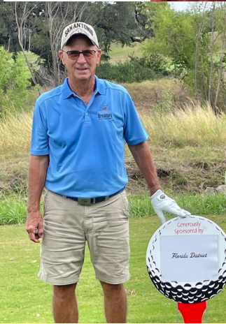
Florida had players in Break-Thru and Walk & Roll