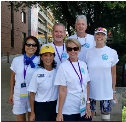
Smiling Faces in Many Places. Fellowship with friends ... new and old